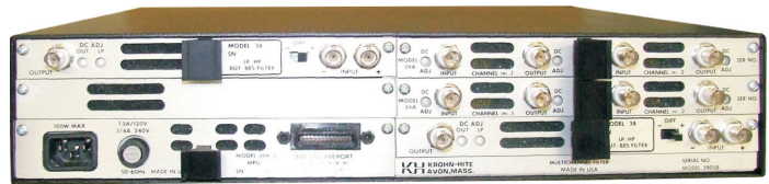
Model 3905C Rear Panel View

Specifications subject to change without notice.